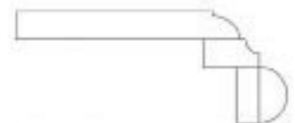
3/4" DUPONT W/ 3/4" PROJECTED COVE W/ 1 1/2" PROJECTED BULLNOSE

Design, Fabrication, Installation and Restoration of Tile and Natural Stone